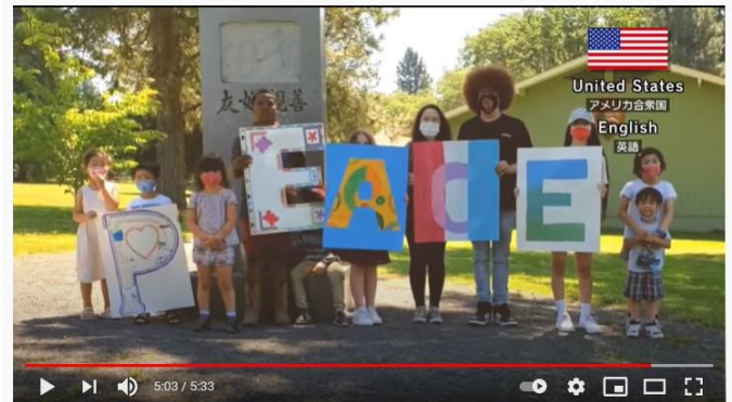
PEACE! Wishes from World's Children