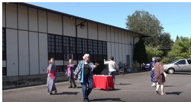
Riverside Ondo (Greet to the left)

Meeting ID: 872 2013 9390 Passcode 962919