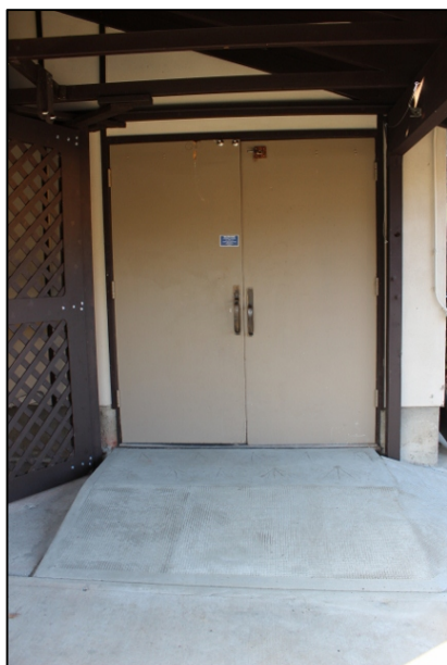
Back entry with ramped concrete access