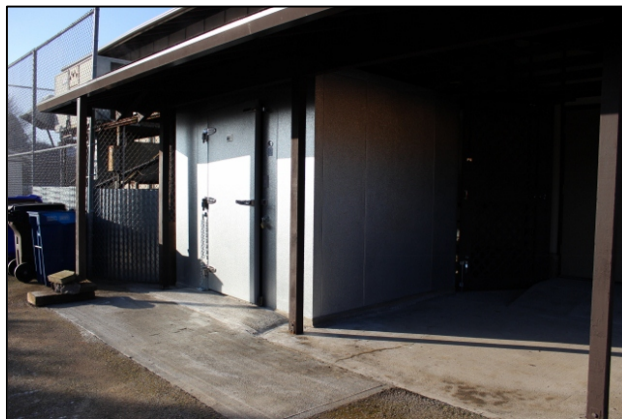
Outdoor walk-in cooler