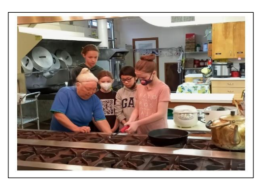
Here they are each practiced using a butane lighter before actually lighting the stove

Then after a visit to the Portland Art Museum they got supercharged and the Juniors completed three badges: drawing, writing and cooking! For writing they created a haiku and a limerick. Aoi created her haiku in Japanese and the girls helped her translate it to English.