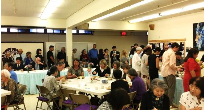
Participants awaiting the ceremony