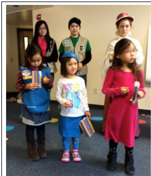
Girl Scout Troop 43720, Rededication and Investiture for 2013 to 2014.